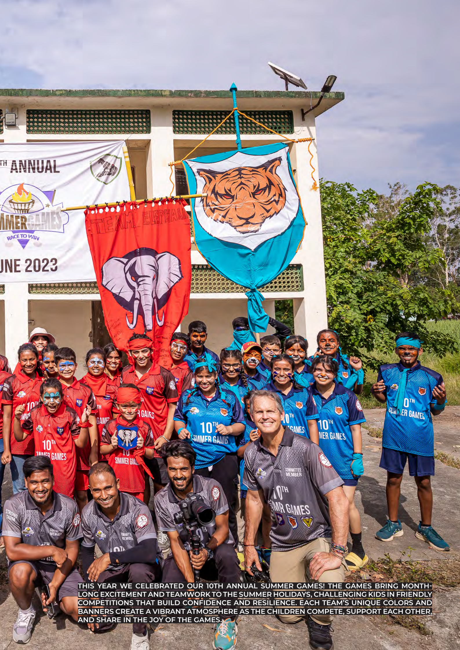
THIS YEAR WE CELEBRATED OUR 10TH ANNUAL SUMMER GAMES! THE GAMES BRING MONTH-LONG EXCITEMENT AND TEAMWORK TO THE SUMMER HOLIDAYS, CHALLENGING KIDS IN FRIENDLY COMPETITIONS THAT BUILD CONFIDENCE AND RESILIENCE. EACH TEAM'S UNIQUE COLORS AND BANNERS CREATE A VIBRANT ATMOSPHERE AS THE CHILDREN COMPETE, SUPPORT EACH OTHER, AND SHARE IN THE JOY OF THE GAMES.